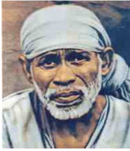
Shirdi Sai Baba